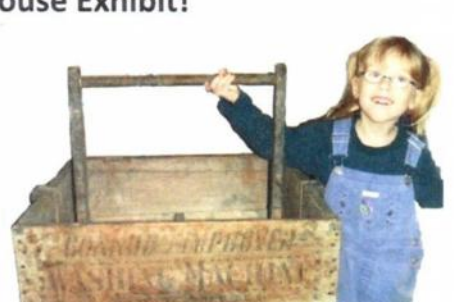
Free admission: Donations on December 14<sup>th</sup> will support Tucker House environmental programs.

GLIMPSE INTO THE PAST of Clarence-Rockland's local history with this special 6-month exhibit.