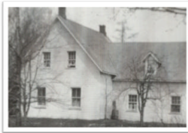
The Gospel Hall on the corner of Old Montreal Road and Faubert Street