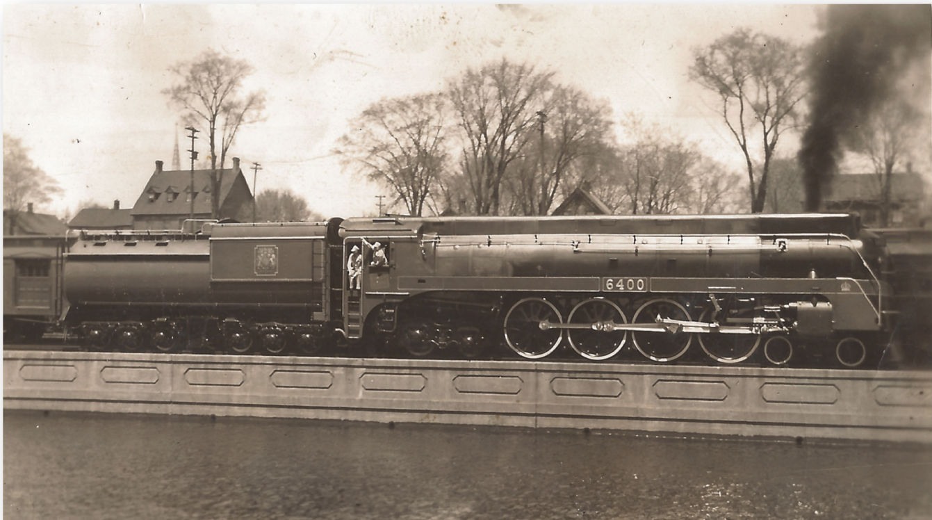
Once the train reached the city just south of Union Station it was switched to a CN locomotive and crew who took it over the CN line to a temporary platform built where the Queensway now crosses Island Park Drive. This photo of the CN-drawn train comes from the Rickerd family, who as CN train men may have taken a special interest. It is sitting beside the canal on what is now Colonel By Drive but was then the train tracks into the main train station (photo from the collection of Verna Kinsella).

But if the government was sending a political message, for everyone else it was a chance to