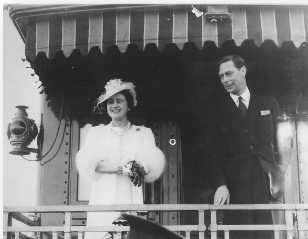
Cumberland Township residents who chose to watch the royal train as it passed were rewarded with seeing King George VI and Queen Elizabeth waving from the observation car at the back of the train.