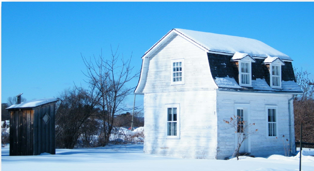
The Dupuis house as it can be seen today at the Cumberland Heritage Village Museum

l'abondance de terres fertiles qu'il vient d'acquérir. Il lance un vaste appel-à-tous aux canadiens-français désirant s'installer avec lui au Canada-Ouest. Plusieurs viendront s'installer auprès de lui.