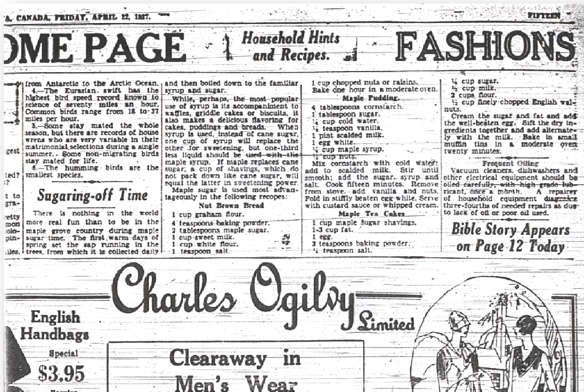
Tips for homemaking in April 1927 included ways to use maple syrup in everyday baking. (The Ottawa Citizen, April 22, 1927, p. 15)