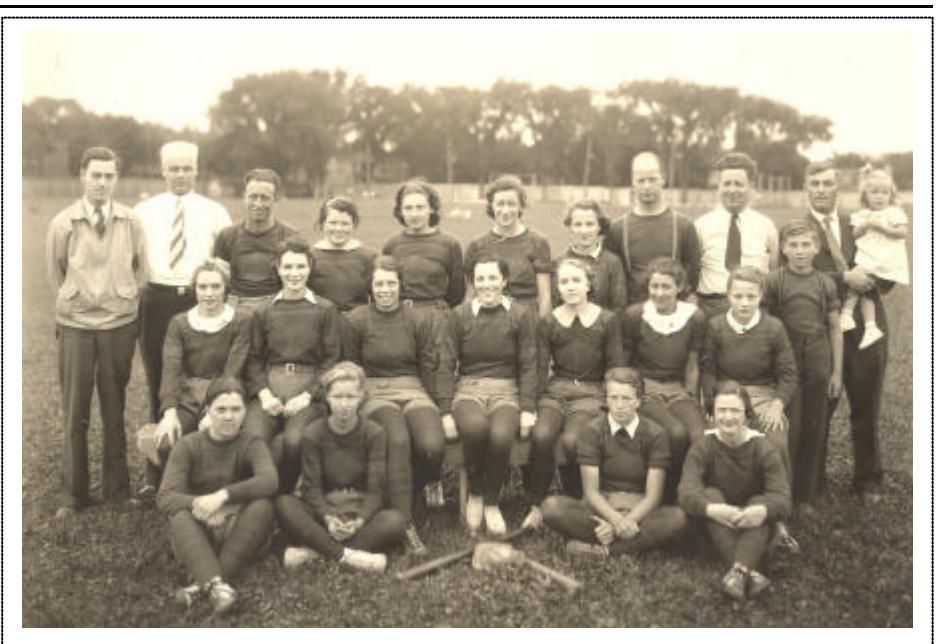
Navan Ladies Softball Team – Senior City League (1937)

the museum. Visit or volunteer, if you can. Plan a family reunion in the backfield. Take your grandchildren on a tour 'down memory lane' with the help of the World Wide Web. Return to the land. Plant a garden, clean up your property and play ball!