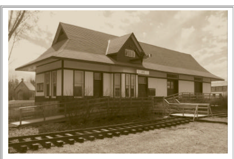
Vars Train Station – today at the Cumberland Heritage Village Museum

Deux derricks du CNF de Montréal ont été amenés pour enlever la locomotive de dessus l'autre wagon. Il a fallu dix heures pour dégager la voie ferrée afin que le traffic ferroviaire circule de nouveau.