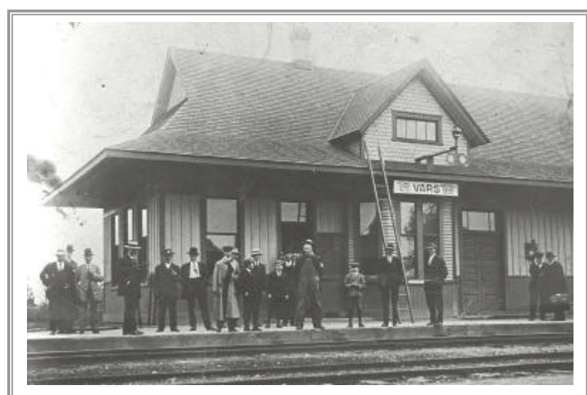
Vars Train Station – from the collection of Verna Kinsella. The station originally belonged to the Grand Trunk Railway and was built in 1908.

Pour ce qui est des dommages matériels, cinq wagons de marchandises ont été détruits. Un wagon était chargé de souliers, et le monde essayait de trouver la paire. Il y avait un wagon avec une