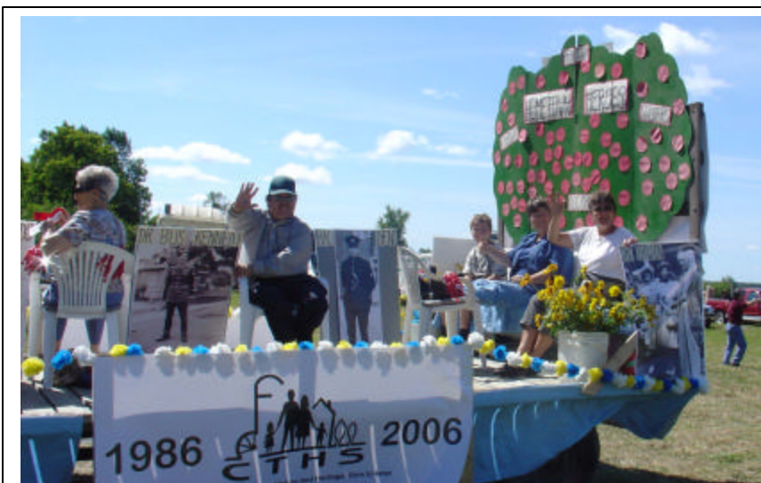
2006 Navan Fair: The winning float

operated a booth (net proceeds were $103.15). In 1948, the Cumberland W.I. operated a food booth. The Anglican Church at Navan also ran a booth. Originally the fair was held on the Saturday of Labour Day weekend, adding Friday in 1948. Ten years later, the fair dates were moved to mid-August, to occur the week before the Ottawa Exhibition. In 1972 the first Sunday fair was held. Since 1974, the Navan Fair has covered four days. The Cumberland Township Agricultural Society was upgraded from a Class "C" fair in 1946, to a Class "B" fair in 1962 which provided more grants to many classes and buildings. In 1981, it became a Class "A" fair.