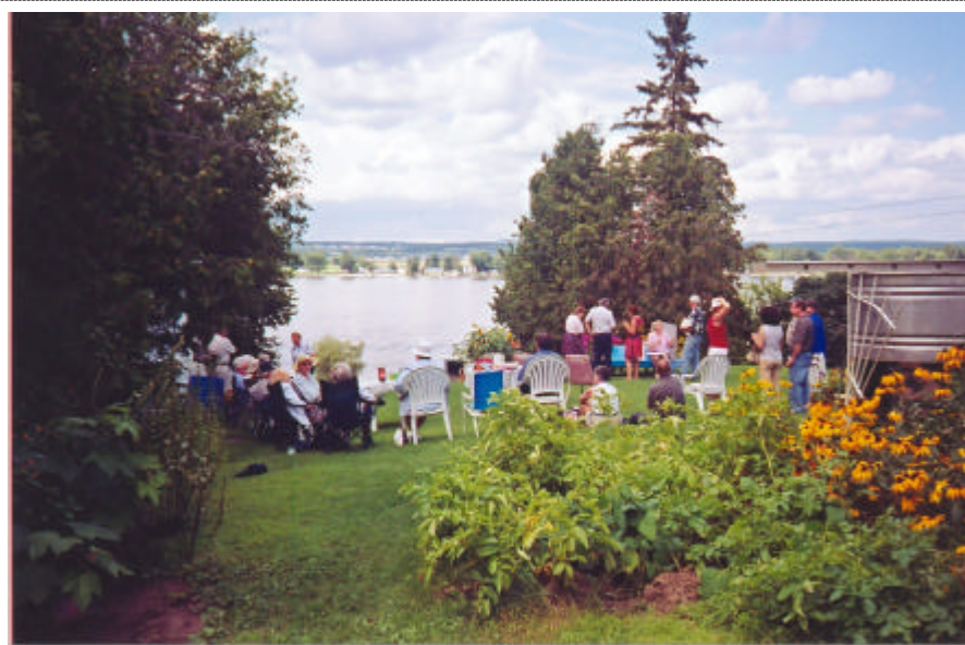
August 2004 CTHS Garden Party