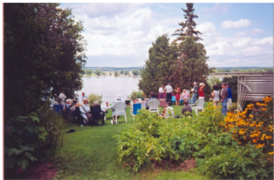
August 2004 CTHS Garden Party